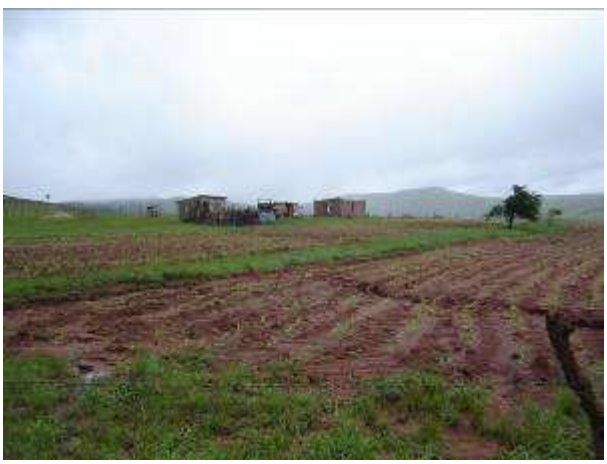
<u>Picture 1:</u> Germinating maize in the middleveld with some washed by the heavy rains

A significant improvement in soil moisture is also expected especially in the western half of the country.