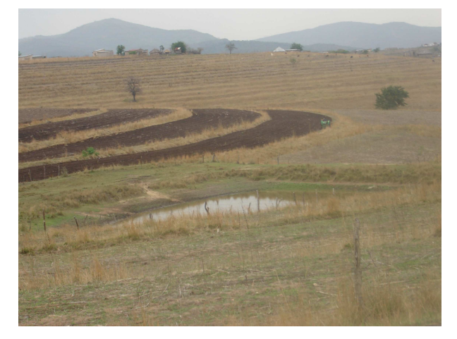
<u>Picture 1:</u> A tractor ploughing a farmer's fields at Luve in the Middleveld

A slight improvement in soil moisture is also expected.