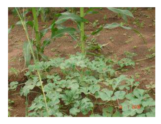
<u>Picture 2:</u> Intercropped melons in a field in Siphofaneni area