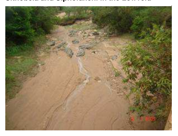
<u>Picture 4:</u> A recently flooded river but returned to no flow in a few days near Sithobela