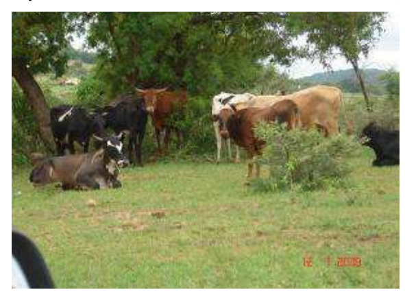
<u>Picture 3:</u> Cattle found browsing between Sithobela and Siphofaneni in the Lowveld