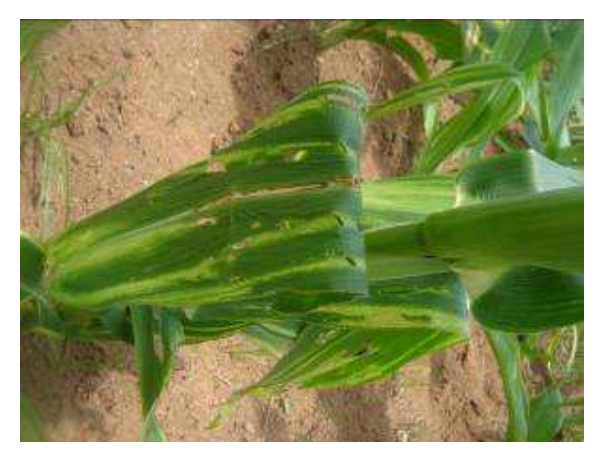
<u>Picture 1:</u> Effects of stalk borer on maize in the Highveld

Stalk borer ( Picture 1 ) infections were noticed in some fields in the Highveld and the Middleveld but were being treated during the reporting dekad.