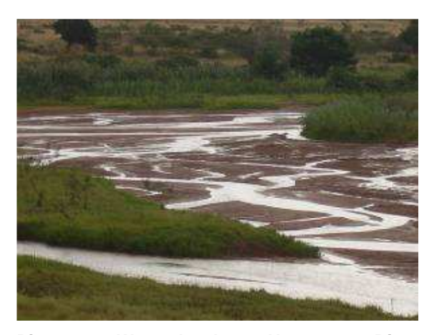
<u>Picture 1:</u> Water levels at Ngwavuma River near Sigwe

Due to the poor rainfall performance so far, rivers in the Lowveld areas have started to dry ( picture 1 ) which is now impacting negatively on irrigation farming and human and livestock water needs. Some of the boreholes drilled as part of the emergency intervention by the Water Crisis Task Team are also not yielding enough for the drought prone communities.