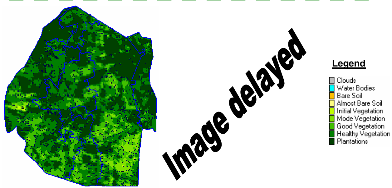
Image 1: Vegetation status as of 1<sup>st</sup> dekad December 2008

Image 2: Vegetation status as of 2<sup>nd</sup> dekad December 2008