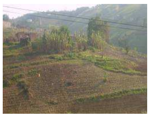
<u>Picture 1:</u> Germinating maize at Mnyokane in the Highveld