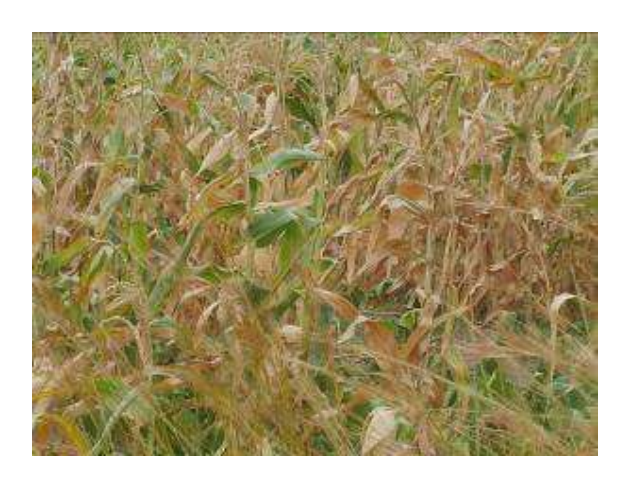
<u>Picture 1</u>: Drying Mature maize in the Middleveld

A slight improvement in soil moisture is anticipated in Highveld and Middleveld, otherwise no improvement is expected in the Lowveld.