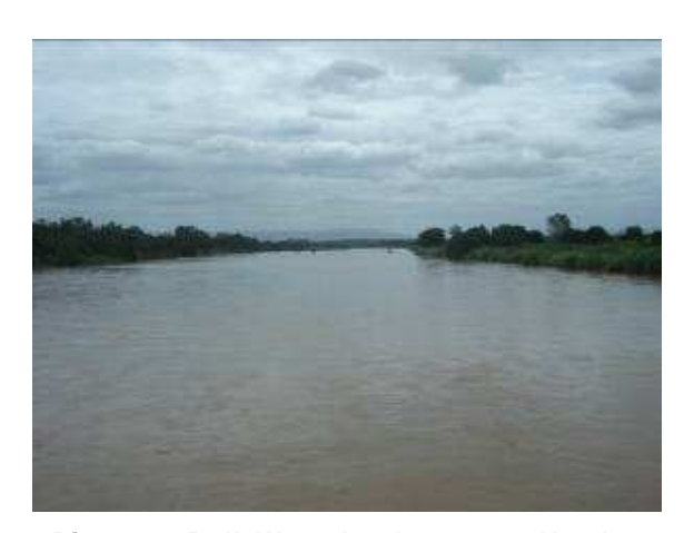
<u>Picture 3:</u> Bulk Water levels at Great Usuthu River