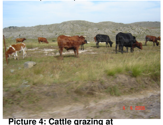
Nsangwini in the Highveld Outlook for 27 April – 12 May 2006

No serious livestock problems have been reported, except for concerns on pasture deterioration by army worms in the Shiselweni region and a national level of preparedness for a possible invasion by avian flu (Bird Flu)