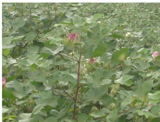
Picture 3: Flower and ball forming cotton crops at Lavumisa in the Shiselweni region