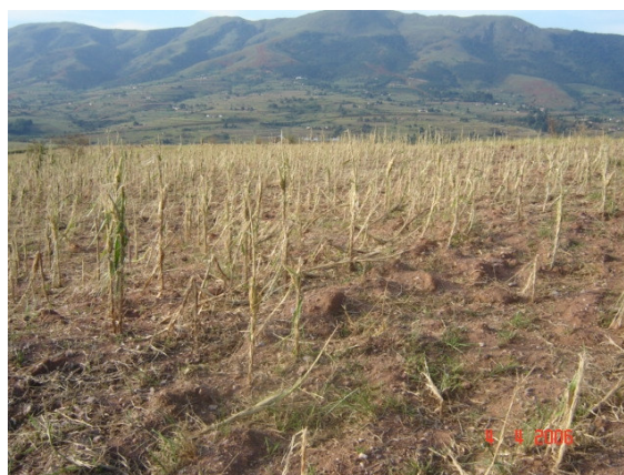
Picture 2: Hailstorm damaged maize crops at Edvudvusini in the Manzini region

A significant decrease in soil moisture levels is expected in this outlook period, especially during the first half of this period.