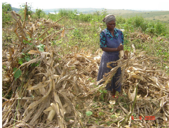
Picture 1: A farmer harvesting maize at Empini in the Manzini region