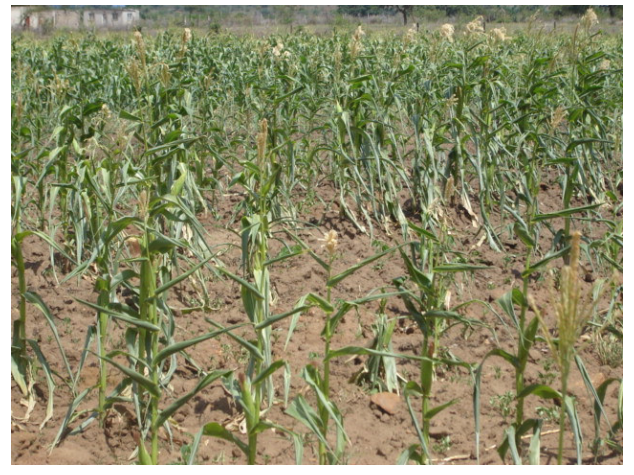
<u>Picture 2:</u> Stunted maize crop cobing at Sithobela in the Lowveld