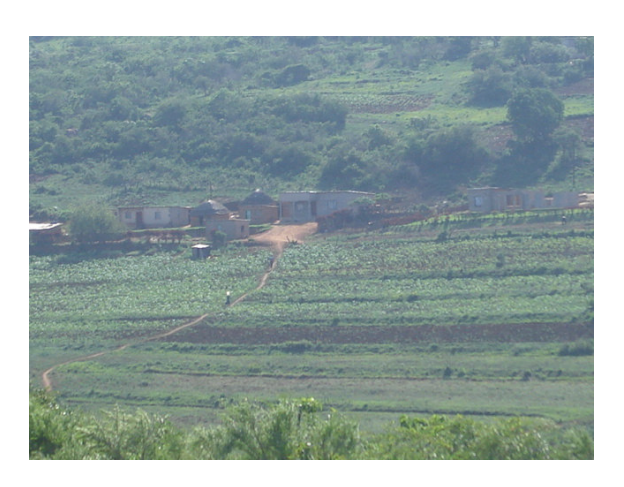
<u>Picture 1:</u> Vegetative maize crops in the Lubombo Plateau

Much improved soil moisture levels anticipated during the forecast period, especially in the southern parts of the country.