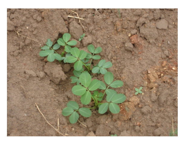
<u>Picture 1:</u> Peanut plant in the Northern Hhohho region

Box 58, Mbabane, Swaziland. (+268) 404 8859 / 404 6274. Fax: 404 1530 E-mail: sunshine@swazimet.gov.sz