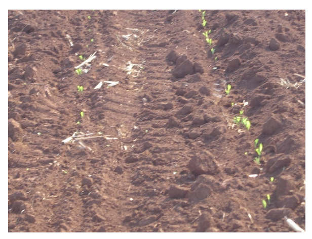
<u>Picture 1:</u> Germinating Maize in the Lubombo region

A normal soil moisture levels is also expected as a result of the normal rains expected.