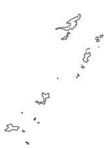
Figure 1. Map of Rainfall distribution (in millimeters) across SVG

At the E.T. Joshua Airport, more than 76% of total rainfall was recorded in the first twelve days. There were 22 rain-days, and a 'five-day' dry spell (14th to 18th). Rainfall records at most stations across SVG showed a similar pattern of the rainfall.