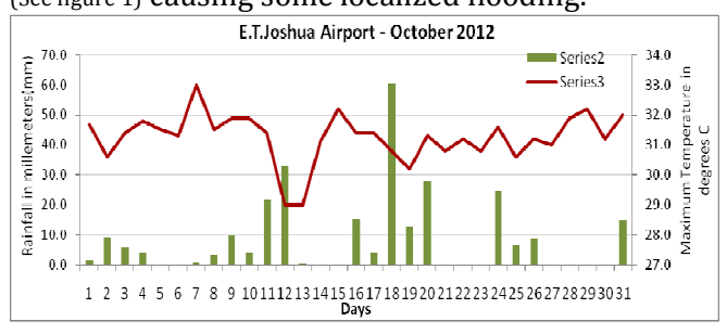
Figure 1. E.T. Joshua Airport rainfall and temperature distribution

Total rainfall for October 2012, at E.T. Joshua Airport-Arnos Vale was 252.8mm (9.94 inches); about 1 inch less than the October 30 year average. (Using 1981-2010 as the 30 year average) On the 12th a strong tropical wave was upgraded to Tropical Storm Rafael to the west of the island chain. Torrential rains associated with this system triggered some landslides in the north of mainland St. Vincent on the evening of the 14th. Then unstable conditions from a trough system which was eventually named 'Sandy'; resulted in 60.4mm of rainfall on the 18th, (See figure 1) causing some localized flooding.