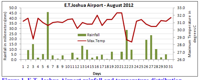
Figure 1. E.T. Joshua Airport rainfall and temperature distribution

Total rainfall recorded at E.T. Joshua Airport-Arnos Vale for August 2012 was 242.2mm (9.54 inches); 5.2 mm more than the long-term average of 237.0mm for August. The highest daily rainfall recorded was 45.9mm on the 6th (1.8 inches; See figure 1). There were 8 days with rainfall less than 1.0mm. On 3rd August tropical storm Ernesto passed North of St. Vincent and the Grenadines and on 22nd August, tropical storm Isaac passed North-North East of the islands, both produced cloudy skies, thunderstorms, occasional gusty winds and periods of continuous light showers which contributed to significant amounts of rainfall. (14.9mm and 28.7mm respectively). Maximum and Minimum temperatures recorded for August were higher than the 30-year averages by 0.4°C and 0.6°C respectively; (See Table 1).