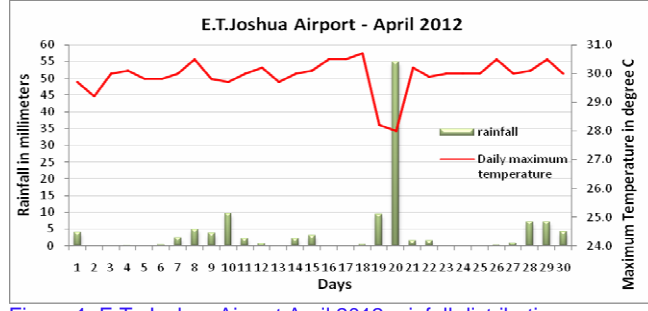
Figure 1. E.T. Joshua Airport April 2012 rainfall distribution

Total rainfall for April 2012 at E.T. Joshua Airport-Arnos Vale, was 120.6 millimeters or 4.74 inches. This was more than the April average of 97mm. The longest consecutive days with rainfall less than 1mm was five days (See figure 1).