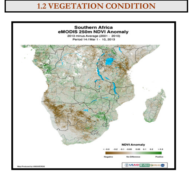
Figure 2: Vegetation Condition over Southern Africa

Map 2 shows the cumulative rainfall performance for the country from 1<sup>st</sup> October 2012 up to 10<sup>th</sup> March 2013. The map shows that most areas in Malawi have achieved normal to above normal cumulative rainfall amounts (green and light blue colours on Map 2) with a few pockets of below average rainfall (yellow colours) by 10 March 2013. For more details refer to Table 1 and Map 2.