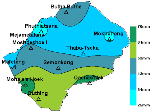
Map 1: 2009 November Second Dekad Rainfall

The second dekad of November recorded above normal rainfall almost throughout the country with the exception of Mokhotlong, Phuthiatsana and some parts of Butha-Buthe with normal rainfall. Qacha's Nek recorded highest dekadal rainfall of 69.4mm while Phuthiatsana recorded lowest dekadal rainfall of 29.9mm (see Map 1 & Fig. 1)