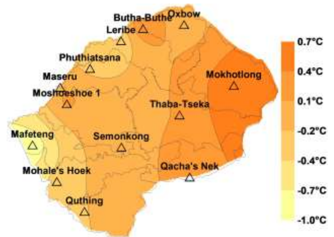
Map 3: Dekadal Mean Temperature Deviation from Normal

Many places remain with a normal record throughout the country. The highest mean temperature deviation from normal for the dekad was recorded at Mokhotlong, at 0.7°C, while the lowest was recorded at Mafeteng, at -1.0°C as shown in Map 3.