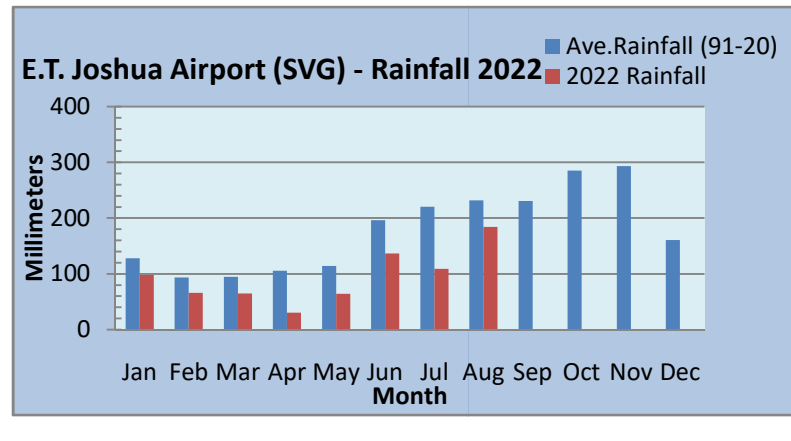
Table 1&2 August, 2022 Rainfall across SVG

The highest maximum temperature 30.3°C was recorded on the 19<sup>th</sup>, while the lowest minimum temperature value of 18.6 °C was recorded on the 30<sup>th</sup>. Average maximum temperature was 30.2 °C and Average minimum temperature was 22.7 °C. Average daily mean temperature was 26.5 °C.