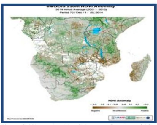
Figure 2: Vegetation Condition over Southern Africa Vegetation condition for Southern Africa up to 20th December 2014 showed that most parts of the region including Malawi were experiencing below average vegetation conditions (Figure 1). As such, natural pastures are likely to be in poor condition.