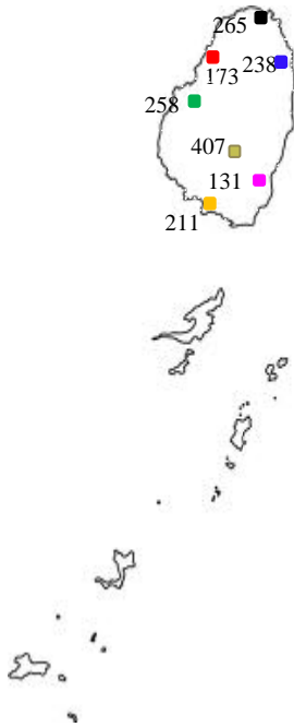
Figure 1. Stations- Rainfall (mm)

For the period 9 th to the 11 th of September, a tropical wave coupled with the northward progression of the ITCZ dumped almost 3 inches (71.5mm) of rainfall at the E. T Joshua station. Thereafter, on the 12 th , instability from the presence of a shear line produced 55.3 mm of rainfall at the station. Instability continued up to the 14 th . Total rainfall at E. T Joshua was 211.1mm. Highest rainfall total was recorded in the South Rivers area which received 590mm of rainfall. Thunderstorms were reported from various areas of the island.