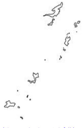
(Figure 1. Stations- Rainfall (mm))

level clouds across Saint Vincent and the Grenadines and brought fair to occasionally cloudy skies with late evening and early morning showers. A few trough systems also added to the monthly accumulated rainfall. Historically, March receives ~82.8mm rainfall at E. T Joshua station; rainfall totals for the month of March 2017 for that station was 136.3 mm. At the International Argyle Airport (A.I.A), total recorded rainfall was