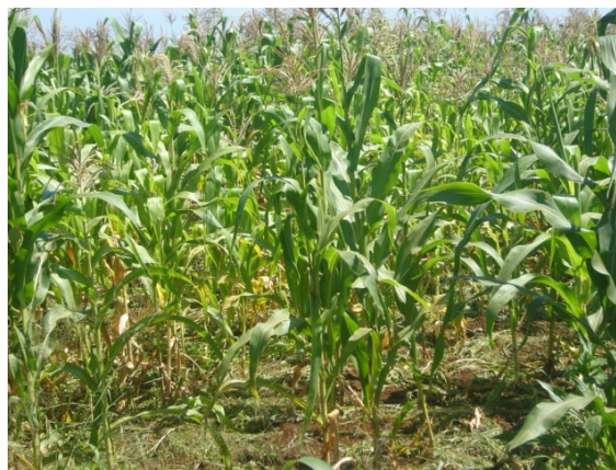
Picture 3: Poorly managed cobbing maize crops in some parts of the Plateau (needs thinning)