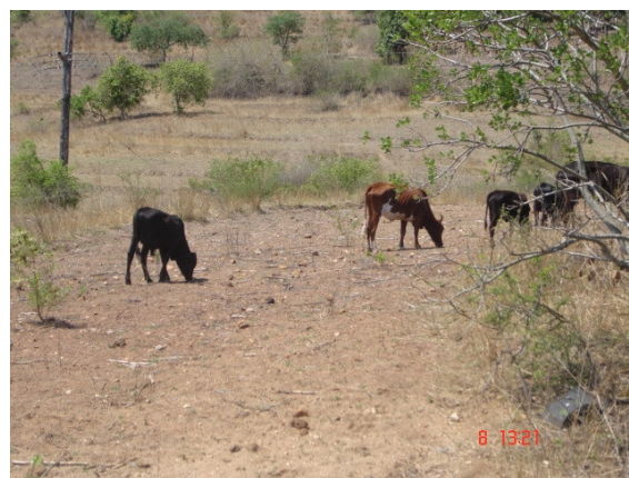
Picture 2: Cattle feeding on almost bare soil at Ngculwini in the Lowveld