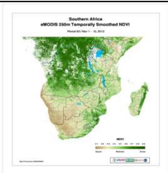
Figure 2: Vegetation Condition over Southern Africa

Vegetation condition map for Southern Africa for the period 1 to 10 November 2012 show signs of slight improvement compared with the previous dekads (Figure 2). This is due to isolated cases of rainfall being received in parts of the region as the rainy season is due to set in. Vegetation condition over Malawi is expected to improve significantly with the rainfall received during this dekad and the previous one.