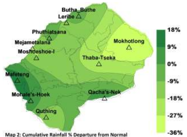
Map 2: Cumulative Rainfall % Departure from Normal

Heavy rains are expected to continue in the 3 rd dekad.