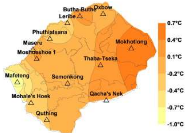
Map 3: Dekadal Mean Temperature Deviation from Normal

Many places remain with a normal record throughout the country. The highest mean temperature deviation from normal for the dekad was recorded at Mokhotlong, at 0.7°C, while the lowest was recorded at Mafeteng, at -1.0°C as shown in Map 3.